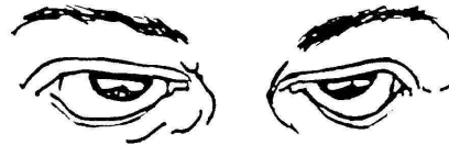
Whites Below, Half of the Iris Showing, and Glassy Eyed

3. Be very cautious. Extreme pressure. These eyes are hiding something.